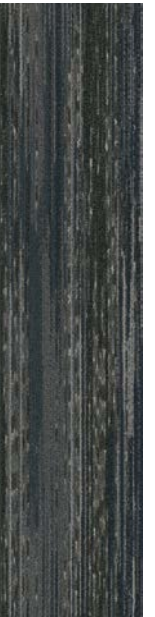
style 7585 color 2751 cable