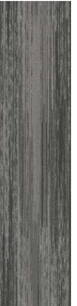
style 7585 color 2744 dimity