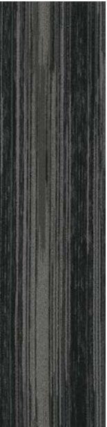
style 7585 color 2740 blend