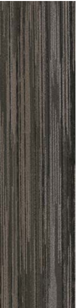
style 7585 color 2741 merino