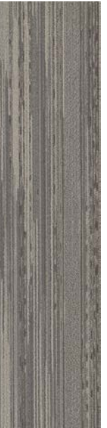
style 7585 color 2743 knit