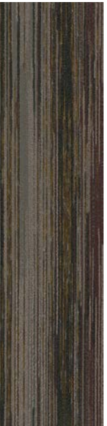
style 7585 color 2748 crewel