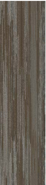
style 7585 color 2747 kashmir