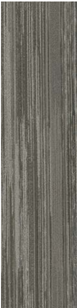
style 7585 color 2746 viscose