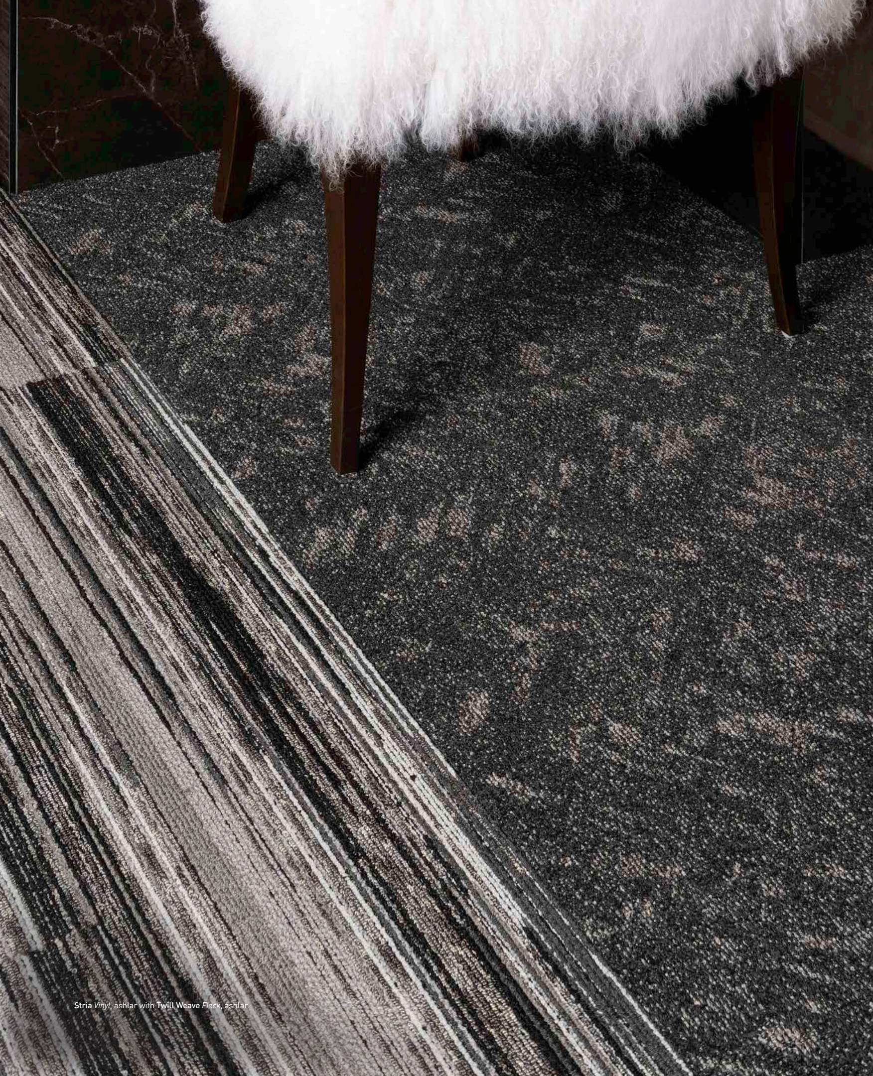
Stria Vinyl, ashlar with Twill Weave Fleck, ashlar