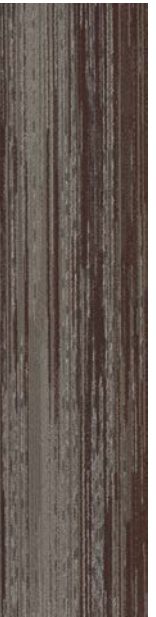
style 7585 color 2749 rib knit