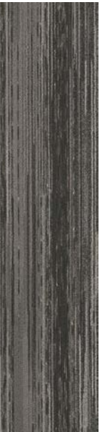
style 7585 color 2752 poplin