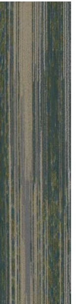
style 7585 color 2750 terry