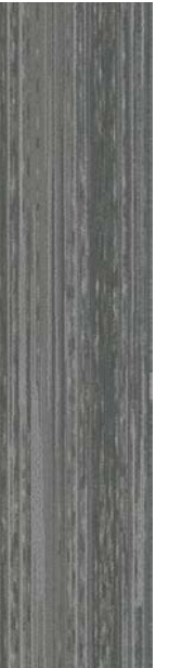
style 7585 color 2745 fleece