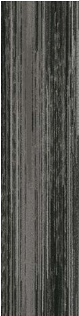
style 7585 color 2739 vinyl