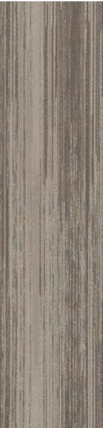
style 7585 color 2742 pima