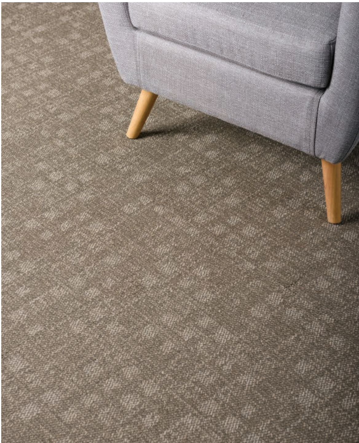
(page 4) Oxford Duck , monolithic and Classics Heirloom , LVT. (above) Oxford Muslin , quarter turn. (page 5 & 6) Madras Duck , monolithic.