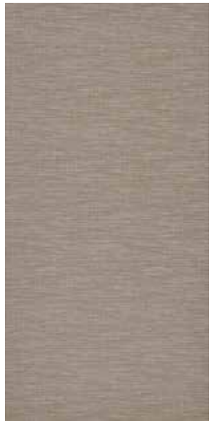
COLOR 1016 straw