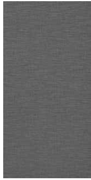
COLOR 1019 edo