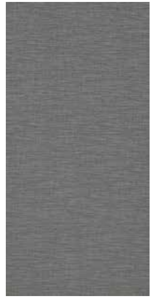
COLOR 1018 kyoto