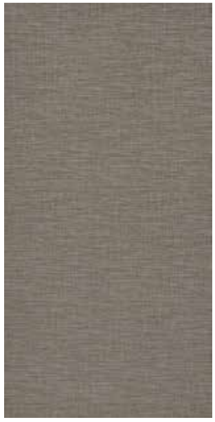
COLOR 1017 nara