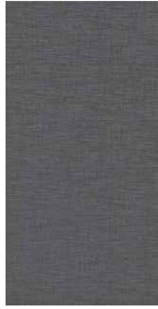
COLOR 1023 zen