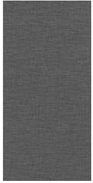
COLOR 1022 wabi