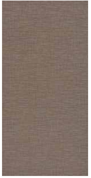
COLOR 1020 rush

TATAMI // ZEN // parquet [back cover] TATAMI // NARA // parquet // FRAMEWORK // ANCHOR // 1/2 drop