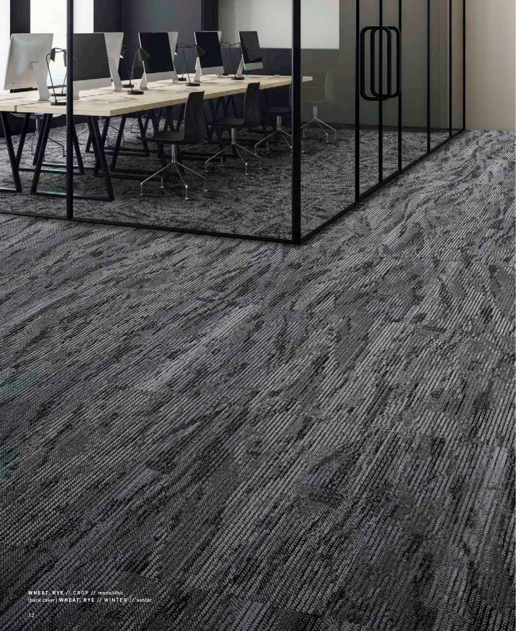
WHEAT, RYE // CROP // monolithic (back cover) WHEAT, RYE // WINTER // ashlar