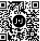
Scan QR Code for backing details

OTHER BACKING OPTIONS: Nexus® Cushion Nexus® FC Cushion