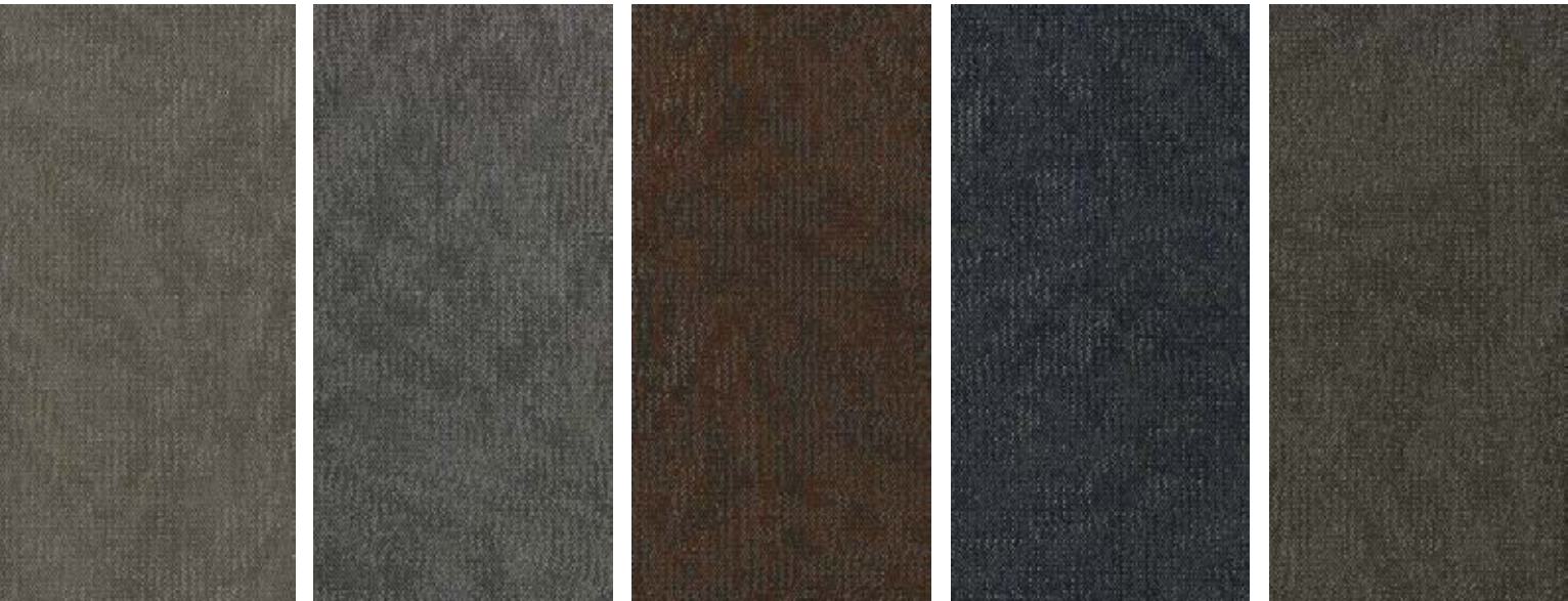
QUICK SHIP COLOR 3750 straw QUICK SHIP COLOR 3749 flour COLOR 3748 rustic QUICK SHIP COLOR 3752 winter QUICK SHIP COLOR 3745 harvest