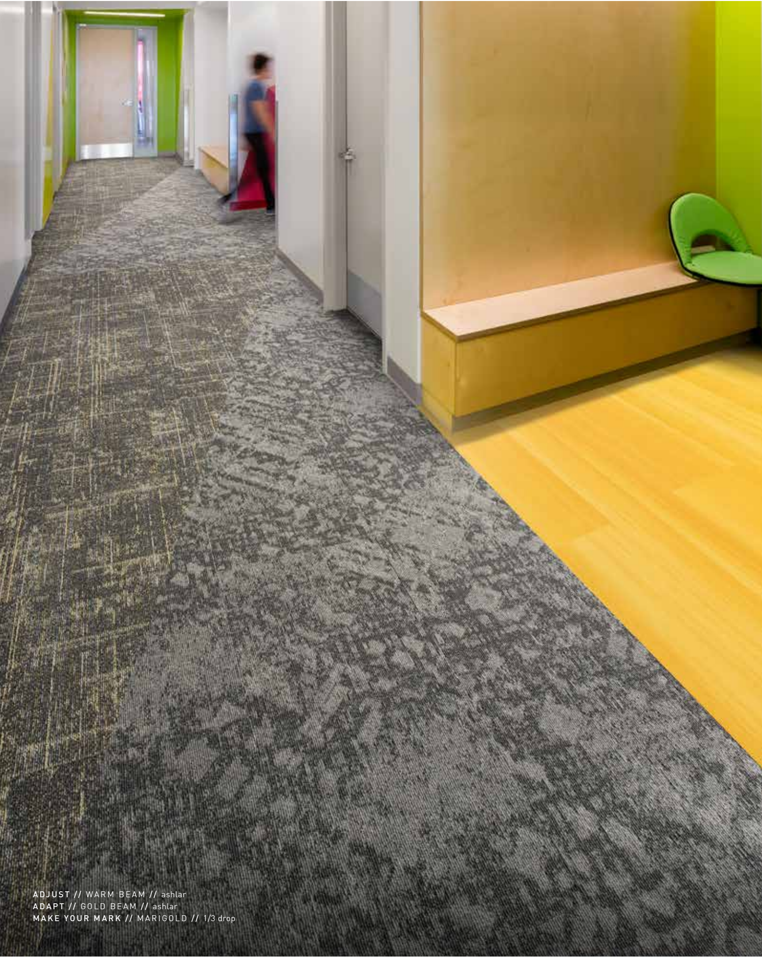
ADJUST // WARM BEAM // ashlar ADAPT // GOLD BEAM // ashlar MAKE YOUR MARK // MARIGOLD // 1/3 drop