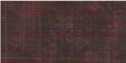
COLOR 3277 brick path