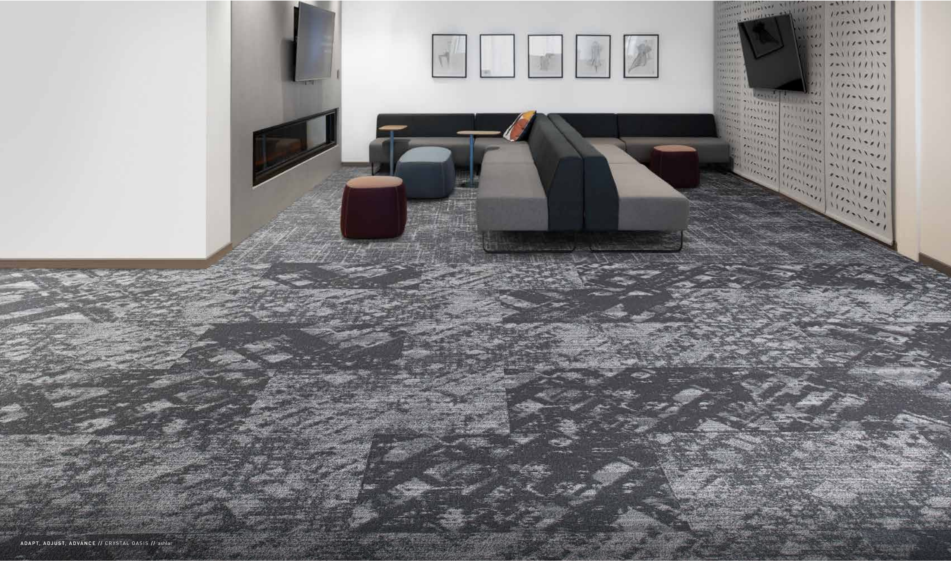
ADAPT, ADJUST, ADVANCE // CRYSTAL OASIS // ashlar