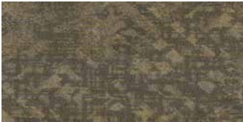
COLOR 3271 gold beam