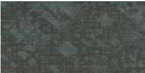
COLOR 3272 azure beam