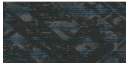
COLOR 3275 royal path