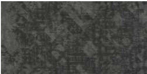
COLOR 3274 carbon path