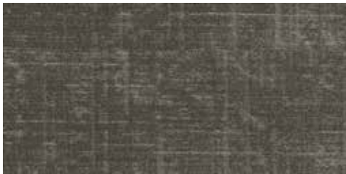
COLOR 3273 light beam