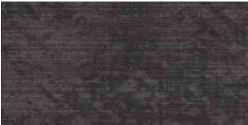
COLOR 3276 plum path