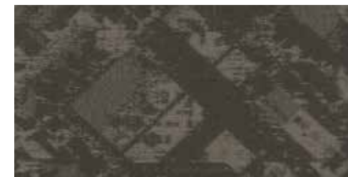
COLOR 3270 warm beam