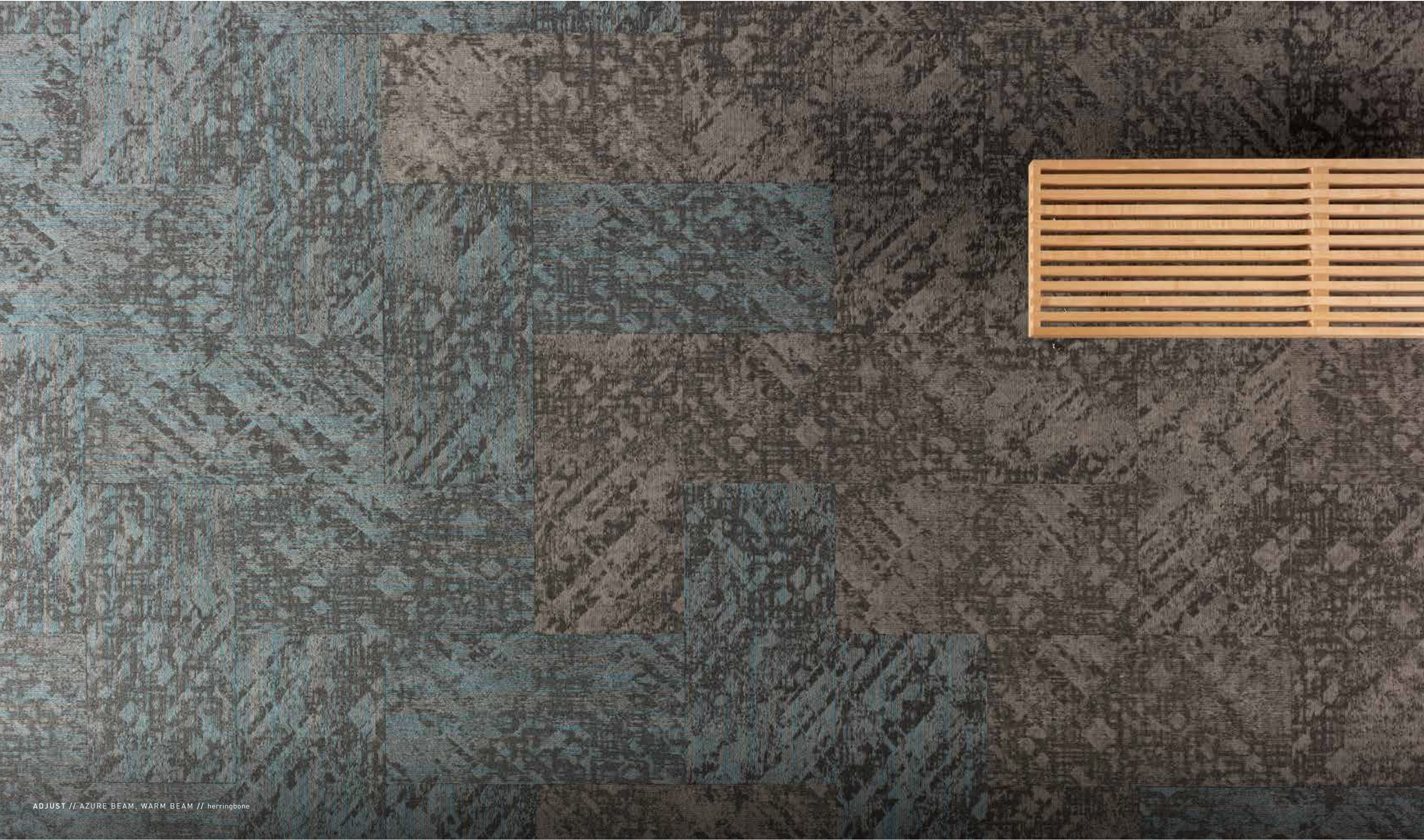
ADJUST // AZURE BEAM, WARM BEAM // herringbone