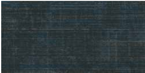
COLOR 3275 royal path