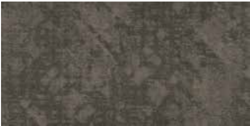
COLOR 3270 warm beam