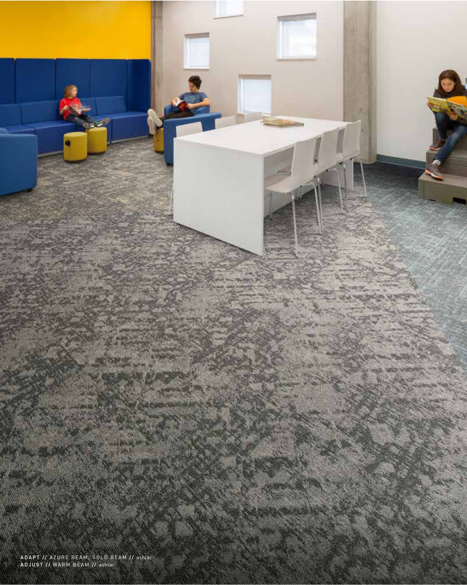
ADAPT // AZURE BEAM, GOLD BEAM // ashlar ADJUST // WARM BEAM // ashlar