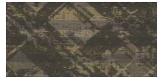
COLOR 3271 gold beam