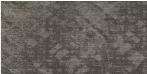
COLOR 3273 light beam