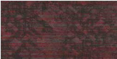
COLOR 3277 brick path