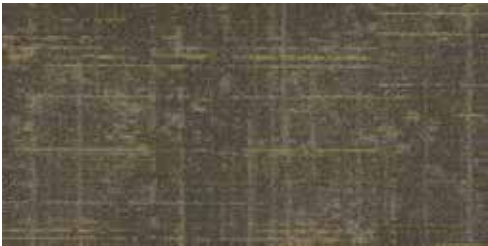
COLOR 3271 gold beam