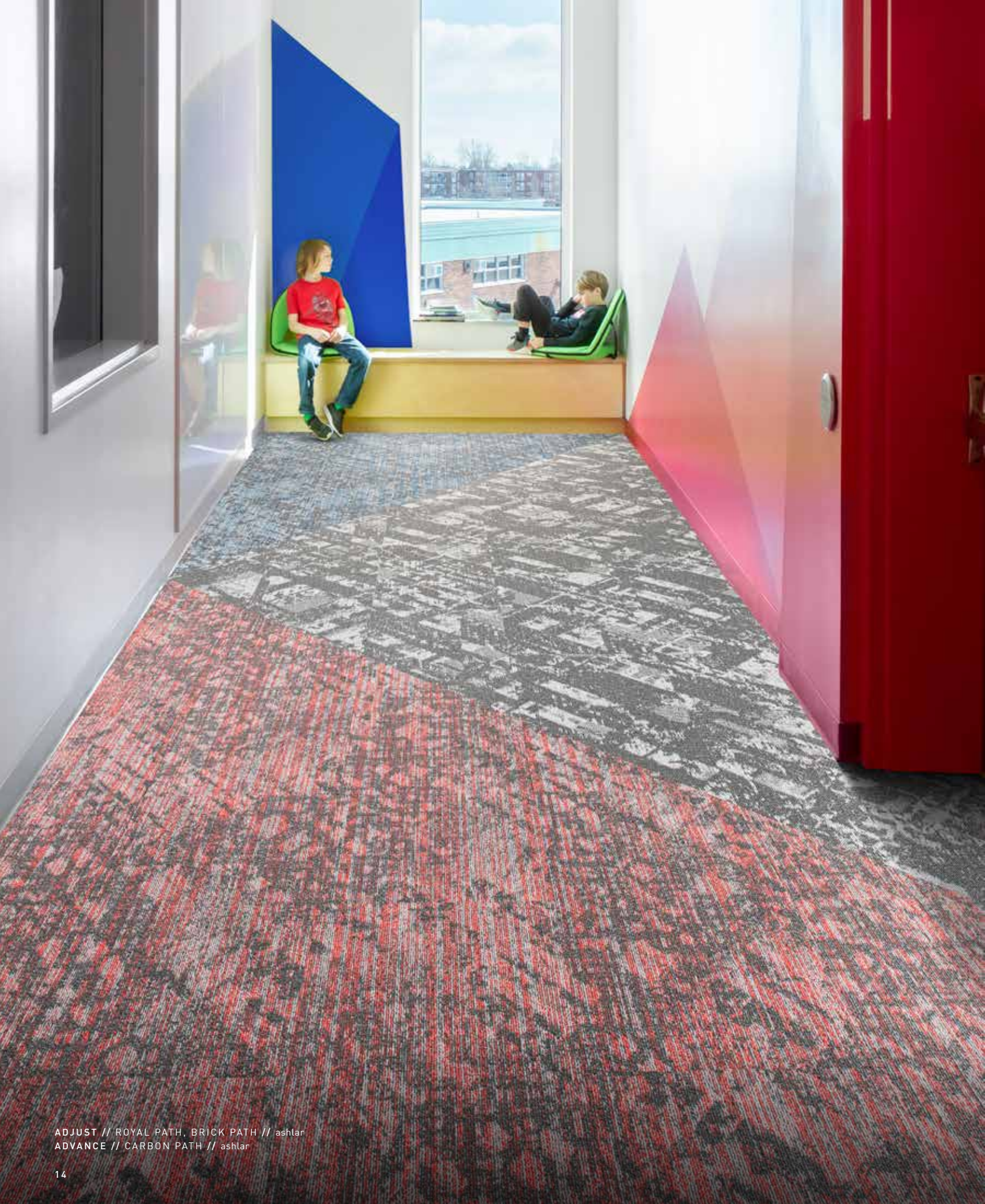
ADJUST // ROYAL PATH, BRICK PATH // ashlar ADVANCE // CARBON PATH // ashlar