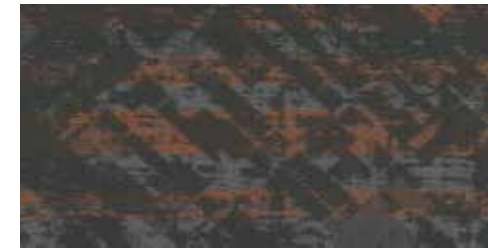
COLOR 3267 citrus oasis