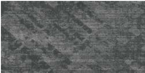
COLOR 3268 crystal oasis