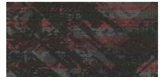
COLOR 3277 brick path