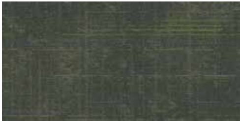
COLOR 3269 lime oasis