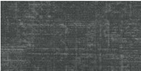
COLOR 3268 crystal oasis