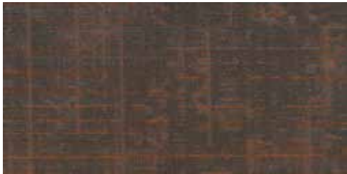
COLOR 3267 citrus oasis