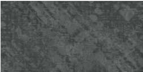
COLOR 3266 cool oasis