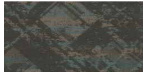
COLOR 3272 azure beam