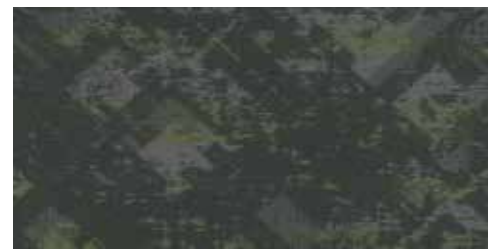
COLOR 3269 lime oasis