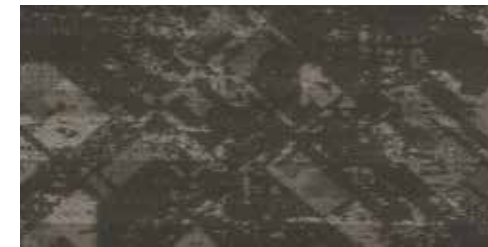
COLOR 3273 light beam