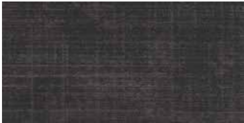
COLOR 3276 plum path