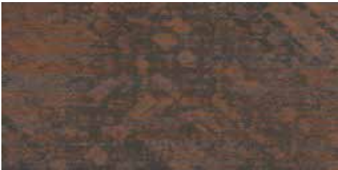
COLOR 3267 citrus oasis