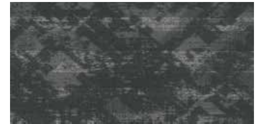
COLOR 3268 crystal oasis