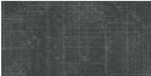
COLOR 3266 cool oasis