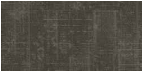
COLOR 3270 warm beam