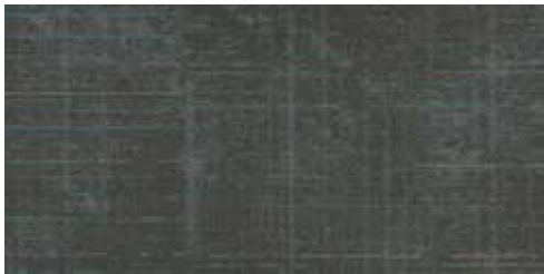
COLOR 3272 azure beam