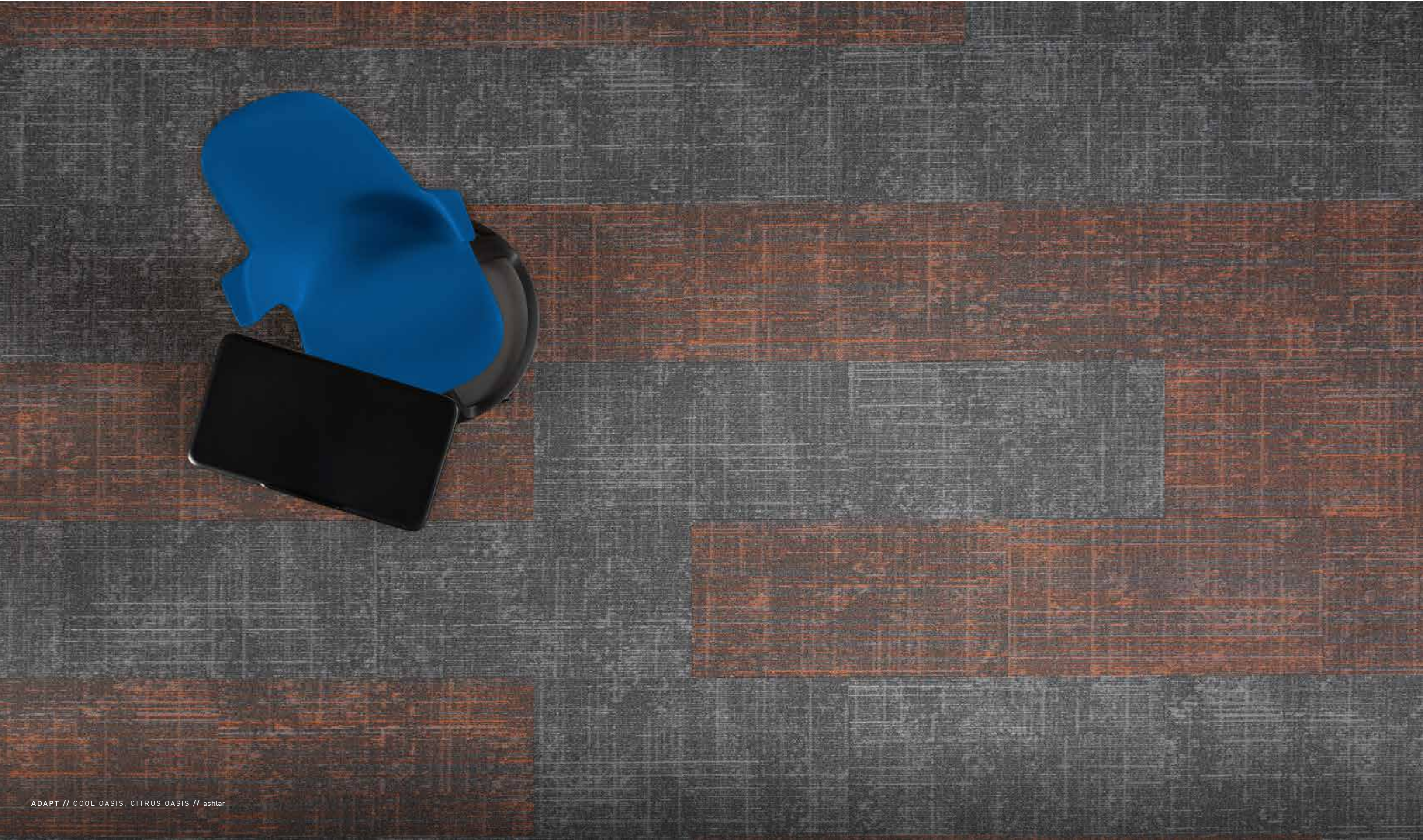
ADAPT // COOL OASIS, CITRUS OASIS // ashlar