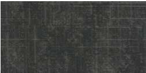
COLOR 3274 carbon path