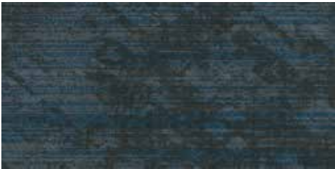
COLOR 3275 royal path