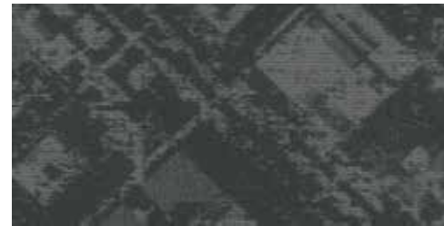
COLOR 3266 cool oasis