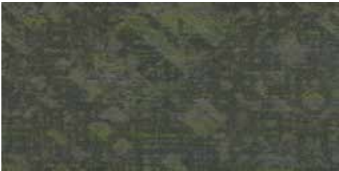
COLOR 3269 lime oasis