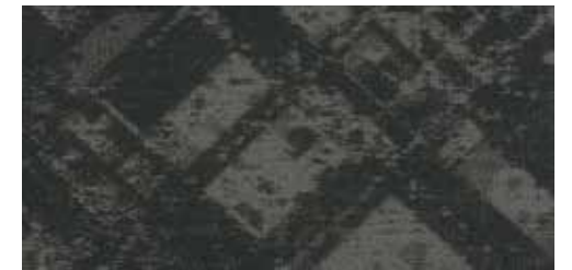
COLOR 3274 carbon path