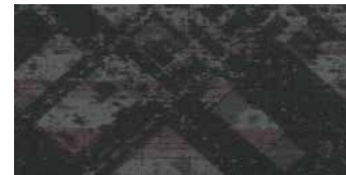
COLOR 3276 plum path