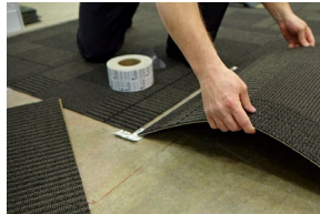
B.1 Position the next module