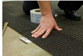
B.2 Press it into place

*Ashlar and Brick installations generally require 35% more TileTabs than Monolithic and Quarter Turn installations. One roll of TileTabs is equivalent to one 4 gallon pail of adhesive or 120 yards when installing 24" x 24" tiles in Monolithic and Quarter Turn installations.