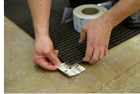
A.2 Place under the module