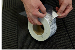
A.1 Peel the TileTab from the roll

C) Continue laying modules and TileTabs at the intersections of the module corners. Apply TileTabs at edges of modules. (See "C" diagrams.)