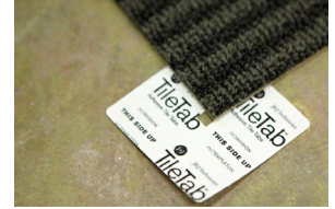
A.3 "THIS SIDE UP" facing up