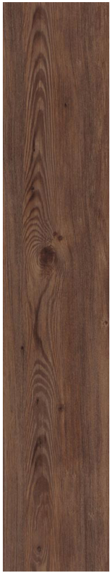
style V5011 color 1007 curio