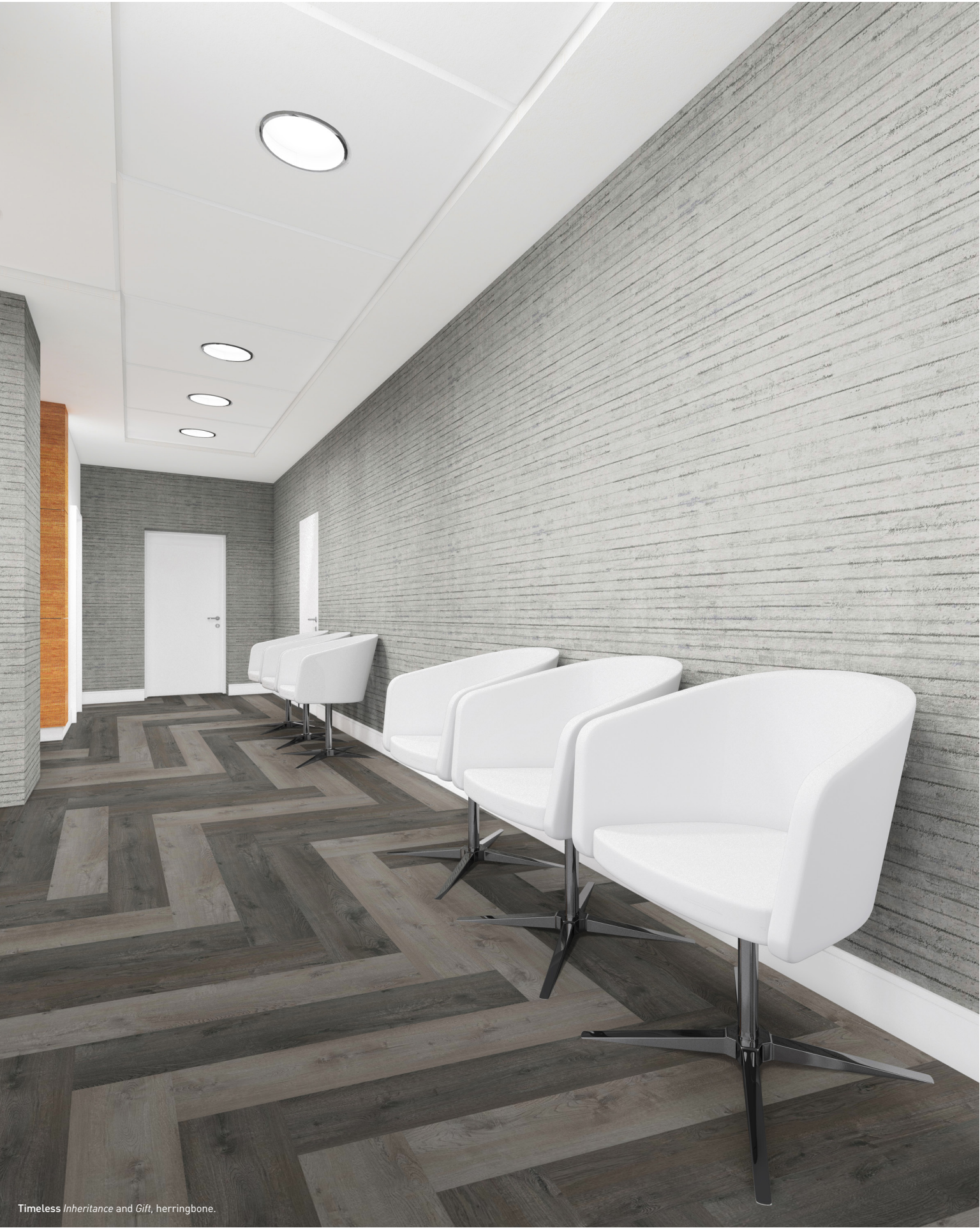
Timeless Inheritance and Gift , herringbone.