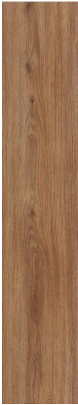
style V5011 color 1003 heirloom