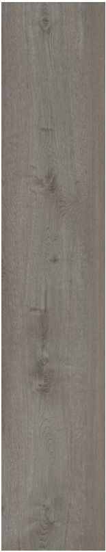
style V5011 color 1060 inheritance