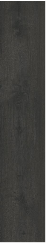
style V5011 color 1062 estate