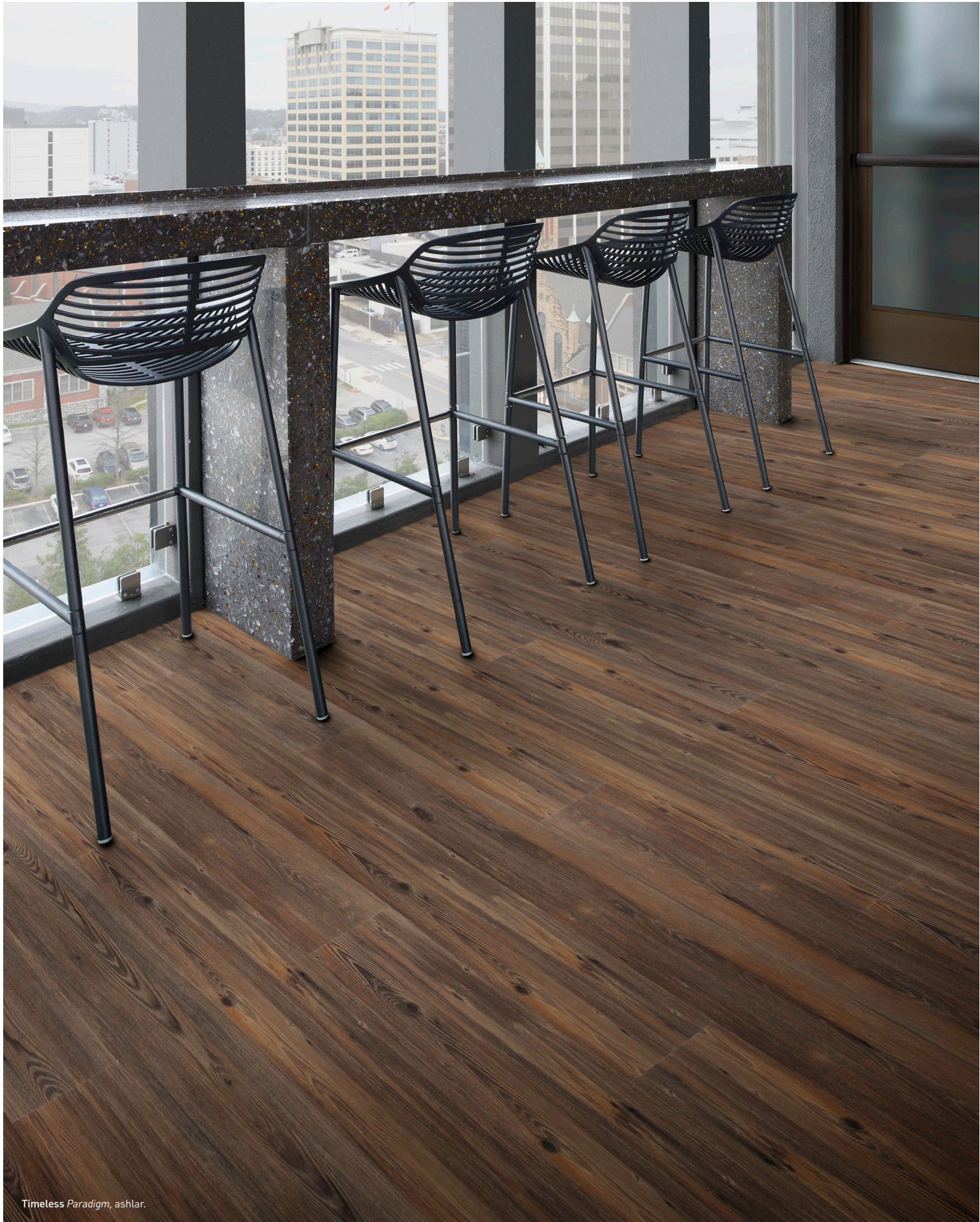
Timeless Paradigm, ashlar.