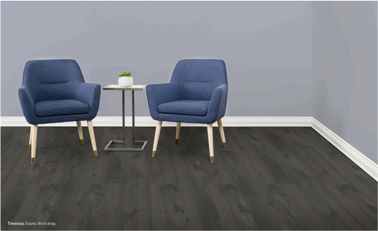
Timeless Estate , third drop.