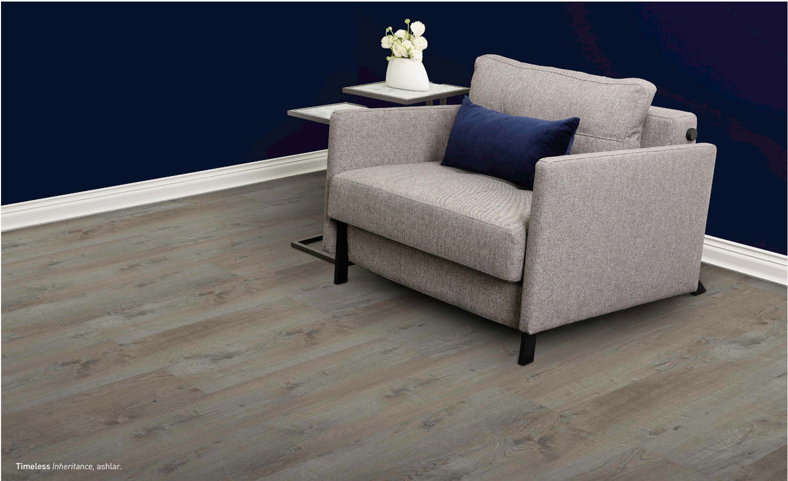
Timeless Inheritance , ashlar.