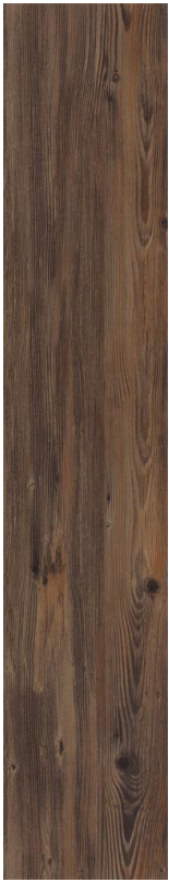
style V5011 color 1008 paradigm