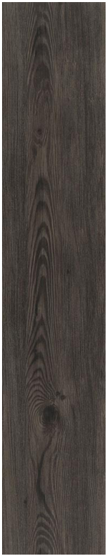
style V5011 color 1009 heritage