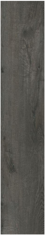
style V5011 color 1061 gift