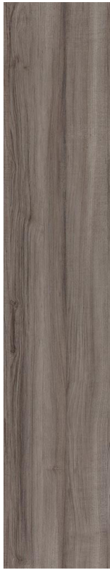
style V5011 color 1000 notable