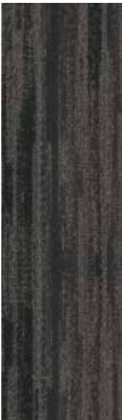
COLOR 3069 incorporate