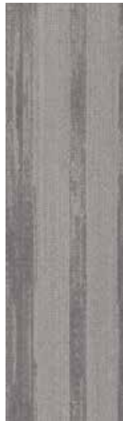
COLOR 3061 coincide