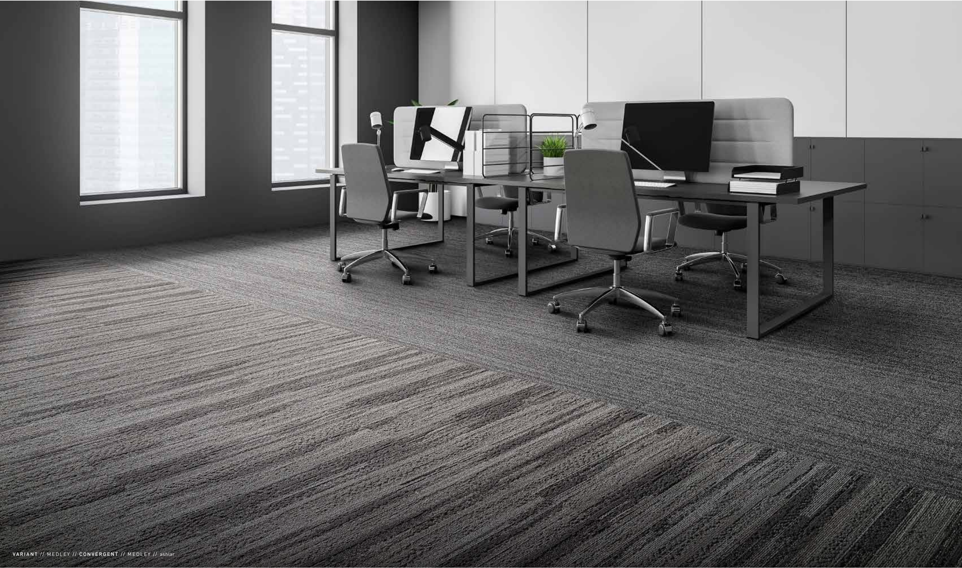
VARIANT // MEDLEY // CONVERGENT // MEDLEY // ashlar