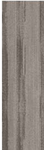
COLOR 3070 compose