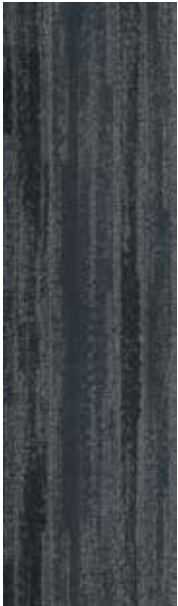
COLOR 3072 unify