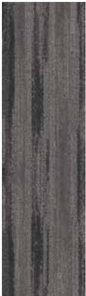
COLOR 3063 synthesize