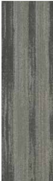
COLOR 3071 blend