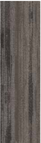
COLOR 3068 combine