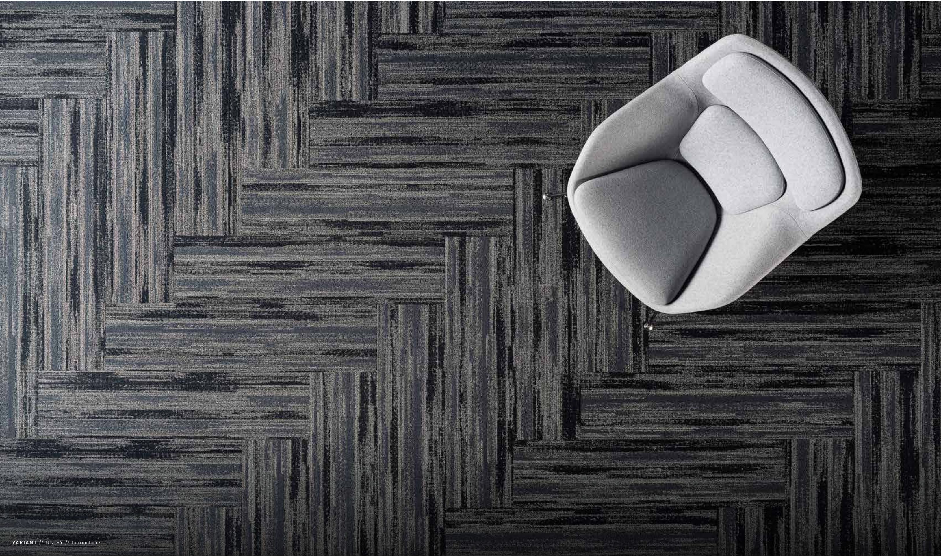
VARIANT // UNIFY // herringbone