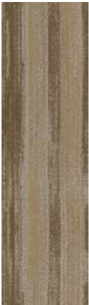
COLOR 3067 meld