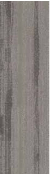
COLOR 3064 consolidate